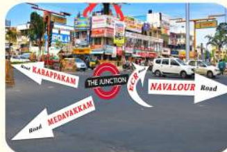
15 MINS FROM SHOLINGANALLUR JUNCTION