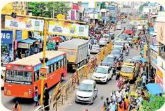
2 MINS FROM KELAMBAKKAM BUS STAND