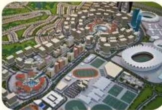
10 MINS FROM GLOBAL SPORTS CITY IN SEMMANCHERI