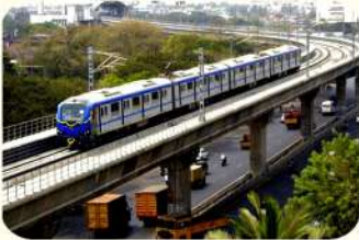
10 MINS FROM SIRUSERI - METRO