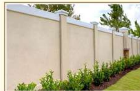
COMPOUNDED COMMUNITY PLOTS