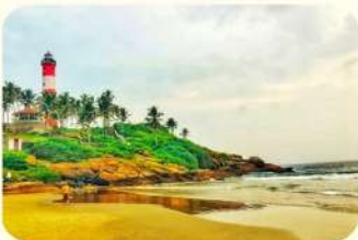
10 MINS FROM KOVALAM BEACH