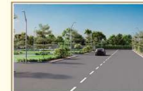
BLACK TOP ROAD