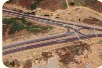
5 MINS FROM OMR - BYPASS ROAD