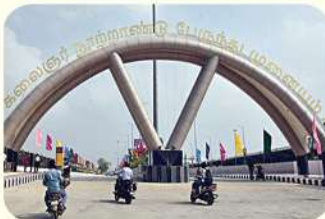
15 MINS FROM KILAMBAKKAM BUS TERMINUS