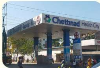
5 MINS FROM CHETTINAD HEALTH CITY