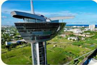
10 MINS FROM SIRUSERI - IT PARK